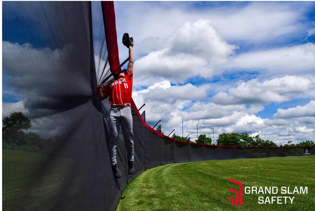
The above photo shows Grand Slam Safety's SPECTO® fence baseball netting.

Cetec ERP is a comprehensive, simple to use and powerfully designed SaaS platform aiming at industry disruption by giving ERP access at low-cost to manufacturers across the world. With all the tools growing small businesses need, Cetec ERP is a home run!