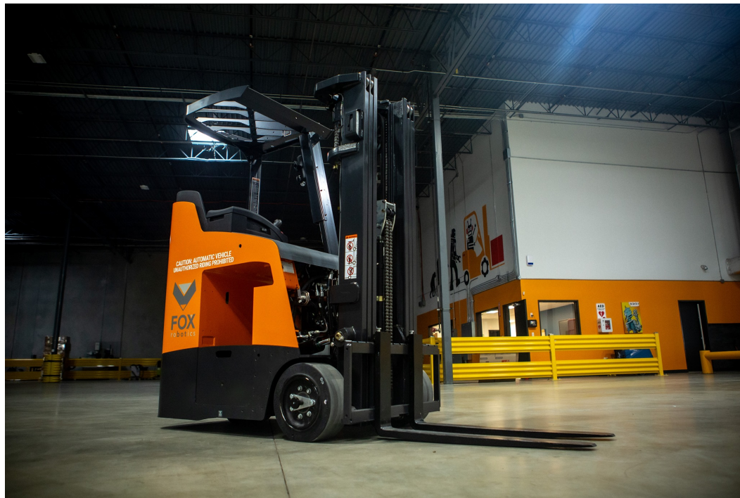
The above photo shows a Fox Robotics automatic forklift.